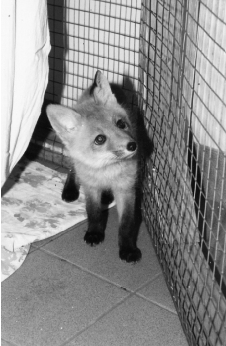
Fred taught us that ninety percent of a fox’s behaviour is pure instinct, bred in the bone so to speak.

Observing the differences in Fred’s response to Gary and me taught us about the relationship between the kits and their parents – the dog fox and vixen. It is in late January or early February that red foxes (often monogamous) court and mate. After a gestation period of approximately 52 days, the kits are born. The average litter contains five helpless, small kits weighing less than a quarter of a pound, explaining why the vixen stays with them so constantly, acting as a thermal blanket in the still frozen ground of March. During this time, the dog fox brings food to the vixen and continues to share parenting responsibilities