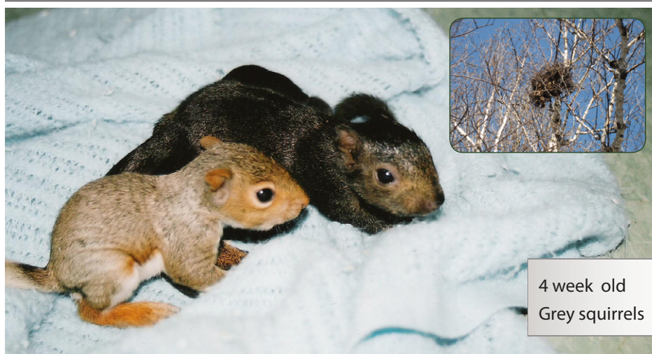
4 week old Grey squirrels